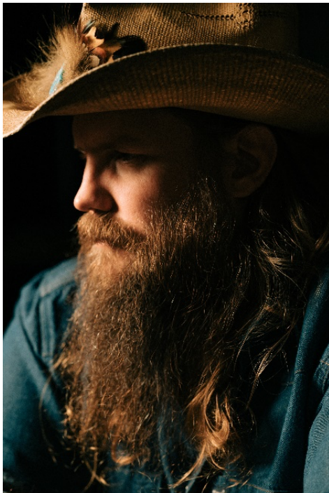
Chris Stapleton Download Photo