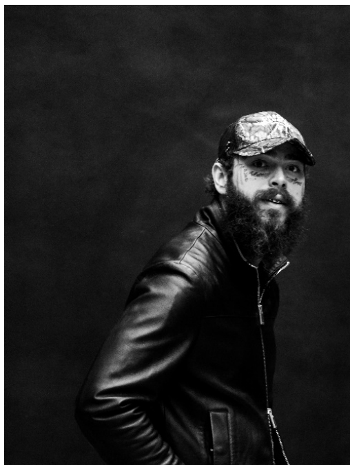
Post Malone Download Photo