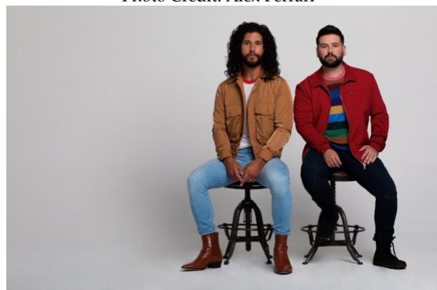
Dan + Shay